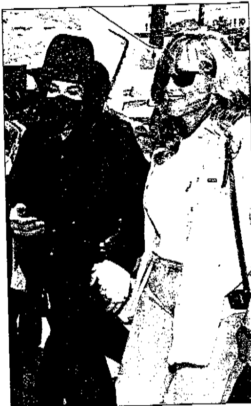
THE TWO MRS. JACKSONS: Debbie Rowe (with Michael in April), was holed up with the masked one in Sydney, Australia, honeymoon suite last night; Lisa Marie Presley (below) issued a statement on her ex' wedding. "No Comment."